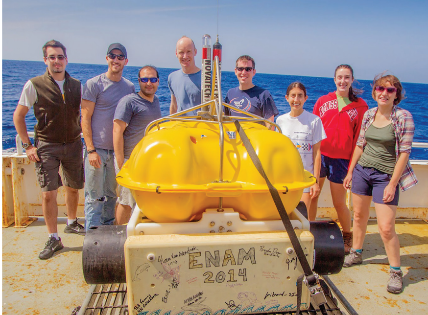
The Science Party and Apply-to-Sail graduate students during the September 2014 OBS deployment campaign part of the ENAM Community Seismic Experiment.

A unique aspect of these GeoPRISMS community experiments is their substantial investments in the professional development of future earth scientists through a range of educational and experiential activities. The 2014-2015 ENAM Community Seismic Experiment (ENAM CSE) and the 2018-2019 Alaska Amphibious Community Seismic Experiment (AACSE) joined a series of community projects that have helped scientists, particularly students and early-career investigators, to gain experience with seismic data collection. These included marine seismic data acquisitions through the Apply-to-Sail program and onshore active-source data field campaigns. Additionally, each project offered experiential opportunities through hands-on workshops, targeted to different populations within the community. Such programs are critical to expanding access to seismic research - particularly in marine settings - to new communities, maximizing the utilization of data collected in community experiments, and recruiting and retaining a more diverse community of earth scientists.